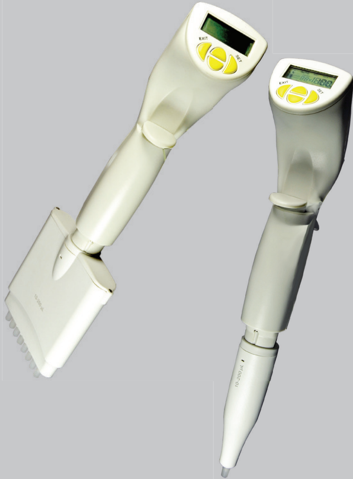
WITOPET EP digital single- and multi-channel pipette